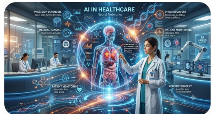
Figure-1: Artificial Intelligence in medical field

Artificial intelligence applications in healthcare: - Disease diagnosis and detection: Compared to human evaluation alone, AI can identify diseases like cancer and heart issues more quickly and precisely by analyzing medical pictures like X-rays and ECGs. Personalized treatment plans: By identifying the therapies that are most effective for each patient, AI evaluates patient data to suggest individualized treatment plans that improve results and minimize adverse effects. Robotic surgery: AI helps in robotic-assisted surgery, allowing for higher magnification and more accurate movements for intricate procedures.