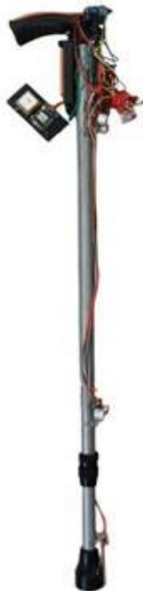
Fig. 3. System Design