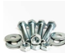
Fig. 6: Button Switch