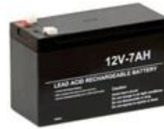
Fig. 4: 25W DC Motor