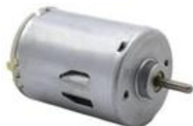
Fig. 3: Plastic Wheels