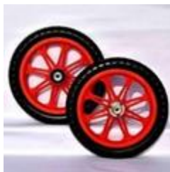
Fig. 2: Nylon Brush