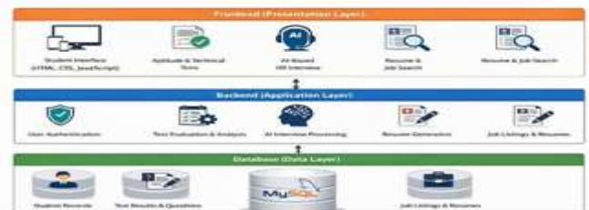
Fig 1. System Architecture

All the data—student info, test questions, results, resumes, and jobs—is tucked away in a MySQL database, locked down for security. Everything's split into modules: Aptitude & Technical Assessment, AI-Powered Interview & Resume Builder, and Job Search & Placement Support. Tied together, the setup gives students a real shot at getting ready for campus placements.