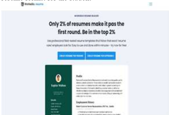
Fig 5. Resume Generation

In the next step, the automated resume builder can be used to create a professional resume for the students. The students can input their personal details, educational qualifications, skills, and project details into the system. The system can then generate a well-structured professional resume in a standard resume format for the student