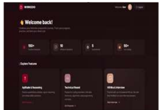
Fig 3. Aptitude and Technical Test Participation

After logging in, students can access the Aptitude and Technical Assessment module. At this point, students can attempt various practice tests that are similar to real company recruitment tests. The tests may consist of questions on aptitude, reasoning skills, and technical subjects. The system will automatically evaluate the options and calculate the marks. This step will help students to identify their strengths and weaknesses in various subject