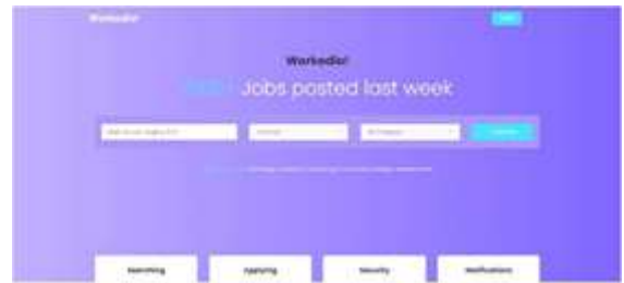
Fig 5. Job search and placement support

Finally, the student has access to the Job Search and Placement Support module. This module allows the student to access different job openings from various companies and receive notifications according to the student's profile and skills. The student can look for the company's needs and apply for the appropriate job roles. This concludes the process by connecting the student's preparation with actual job opportunities.