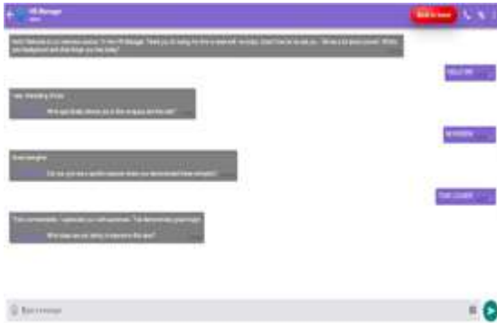
Fig 4. Ai-based interview practice

basis of their communication skills, confidence level, etc. Feedback is then given to the student to help him or her perform better in the interview situation.