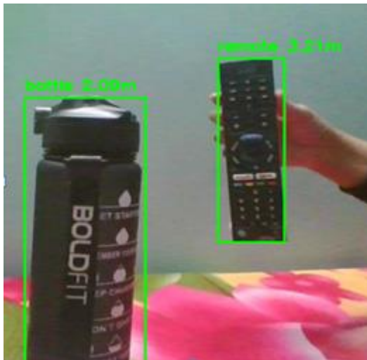
Figures2 and 3 depicts of equalitative detection results of the proposed YOLOv8 model in different real-world