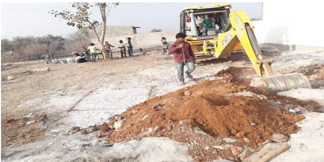
Figure. 10 EXCAVATION