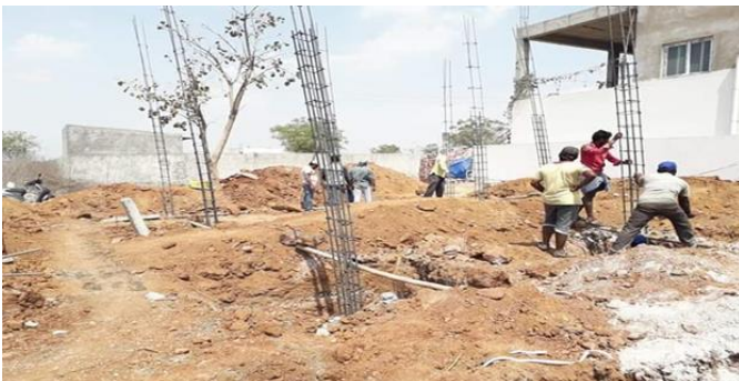
Figure. 11 FOOTING