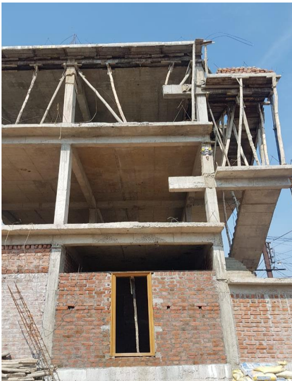
Figure. 15 BUILDING