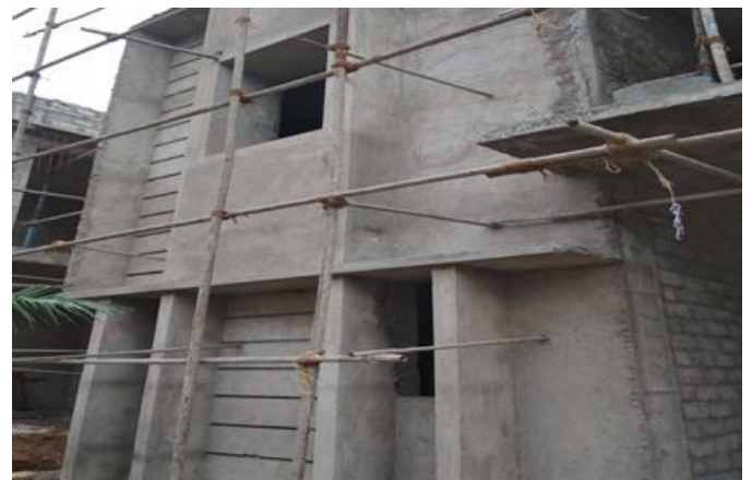
Figure. 9 Plastering

Three coat work is usually specified for all good works. It consists as its name implies, of three layers of materials, and is described as render, float and set on walls and lath, plaster, float and set, or lath, lay, float and set, on lath work. This makes a strong, straight, sanitary coating for walls and ceilings.