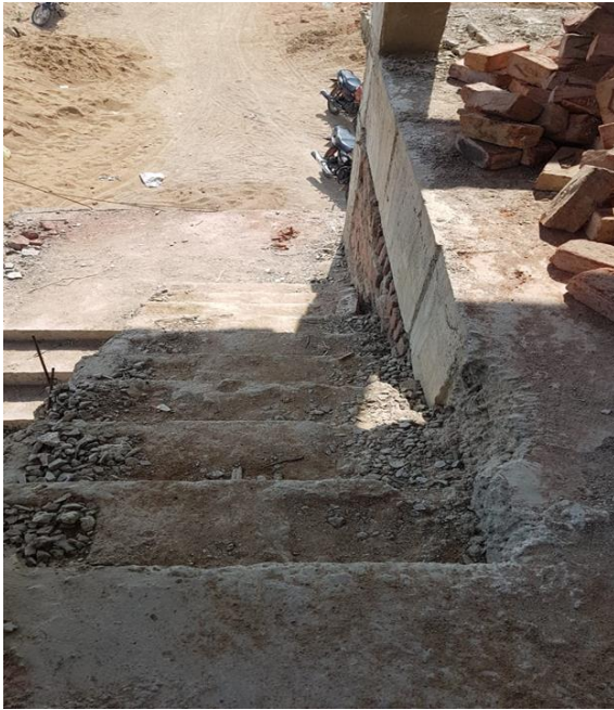
Figure. 14 STAIRCASE