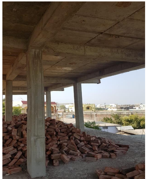
Figure. 13 BEAMS