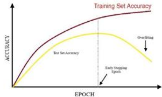
Fig. 4. ANN Testing And Training Accuracy

Career Compass continuously adapts through user feedback loops, refining recommendations over time. Real-time data ensures the system remains up-to-date with market trends. The AI-driven mock interviews and resume analysis provides students with actionable insights, boosting their confidence and readiness for job applications.