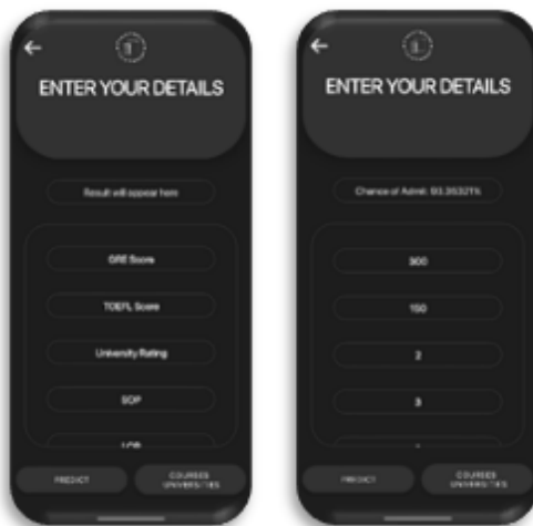
Fig. 3. Output For Admission Prediction Using Ann

Performance metrics indicate significant improvements over the previous model. Precision and recall scores have increased, while user surveys report a 15% rise in satisfaction due to personalized recommendations and the interactive AI assistant. Higher studies admission prediction accuracy now surpasses 92%, supporting students aiming for postgraduate education.