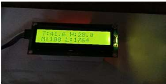
Fig.No 5: Real time data