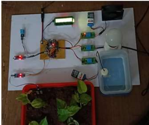
Fig.No 3: Beginning of project