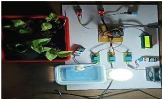
Fig.No 4: Output of LDR