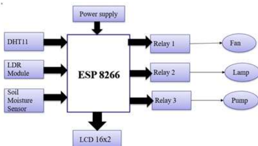
Fig. No. : 1 Block Diagram of The System

This project is an IoT-based greenhouse monitoring and controlling system using ESP8266. It uses four sensors to track light, temperature, humidity and soil moisture. A temperature sensor controls a fan to keep the temperature within the desired range. A light sensor adjusts a shade (using a DC motor) if the sunlight is too strong. The humidity sensor and soil moisture sensor control a blower and a water outlet to maintain the right levels of moisture and humidity. These actions are managed by a microcontroller, which sends signals to relays that control the devices, making the greenhouse more automated.