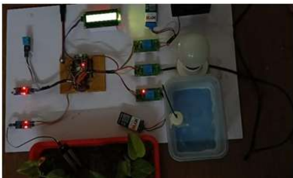
Fig.No 6: Output of soil moisture