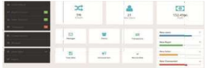
Figure 12: Control panel of the website.

information, and bounce rate information. New buyers will be able to see the past information of any previous buyers, making this method extremely trustworthy.