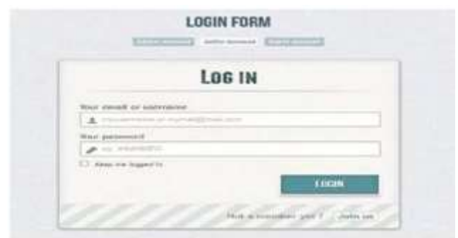
Figure 4: Login page for a seller account.

The buyer will fill out the registration form with various pieces of information, like their username, e-mail address, and password. They will also type the password they used to