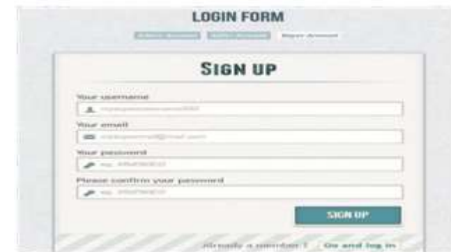
Figure 5: Sign-up page for a buyer account

Chain and Data Component. This section introduces the basic notion of smart contracts by discussing the nature and types of contracts. From a legal and economic standpoint, we first outline the basic aspects of contracts and their various roles throughout the relationship lifecycle. Then, after examining several ways of defining smart contracts, we offer a broad definition. This part concludes with a critical examination of the role of distributed ledger technology in the idea of smart contracts. In Figure 8, it shows all the functions which have been imported. The date time function is used for each block to have its own timestamp when the block is created and mined. The hash function will need to hash the blocks because the hash function will be used here.