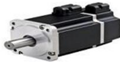
Fig 2. Servo motor.