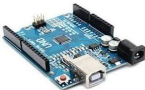
Fig 3. Arduino.