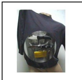
Fig 1. Data Acquisition.

The data acquisition was done with a Millimeter-Wave Linear Stepped Frequency Radar system (SFMCW) principally usable within the complete Wave guide band, i.e. 75GHz . . . 110GHz. The cylindrical synthetic aperture was covered by sensor rotation about the z -axis and by a linear movement in the same direction. The TX power used was about 0 dBm. The frequency range was chosen to 90GHz to 100GHz including 201 frequency samples. These parameters lead to a range resolution of 1.5 cm and a range unambiguity of 3m well suitable for the application. The extent of the synthetic aperture was chosen to: L_{z_a} = 0.2m , with n_{z_a} = 101 discretization steps and L_{\theta_a} = 60^\circ , with n_{\theta_a} = 201 angular increments as described by Fig. 1.