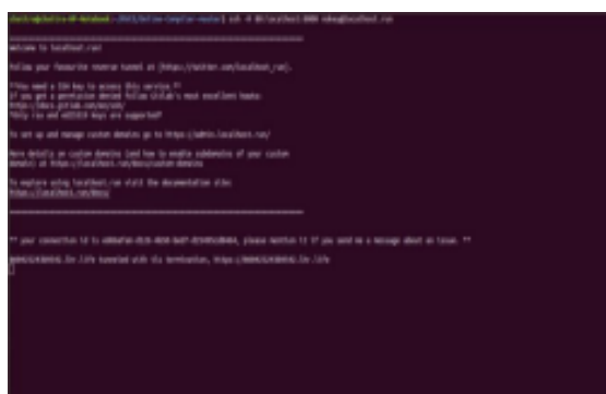
Figure2 Hosting on Internet

The main aim of On-Com is the website will be available online and users can use anywhere on any device. So, to make the localhost available online on the