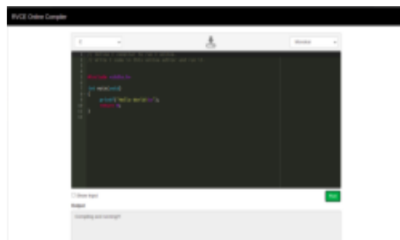
Figure.2 On screen C programming .

This is the default code for C programming. Users need to select language in the dropdown menu and the default code for each programming language will be present in the code editor. Users can edit the code, compile and execute using the run button.