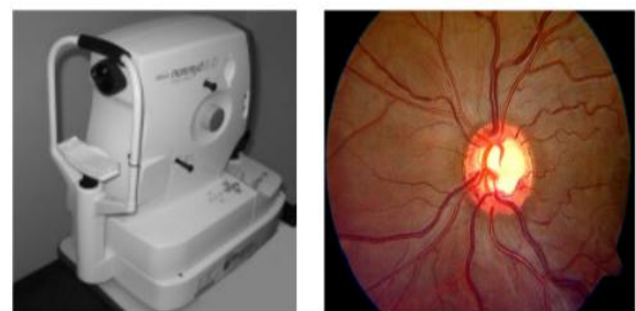
Fig 1. Digital fundus camera and acquired retinal fundus image.

special devices called ophthalmoscopes. Medical image analysis and processing has great significance in non-invasive treatment and clinical study. The information about the optic disk can be used to examine severity glaucoma. The location of the optic disk is an important issue in retinal image analysis as it is a significant landmark feature. Fig.1 shows the fundus camera and retinal fundus image.