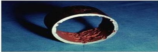
Fig. 2. Oxygen Pitting.

Whereas element corrosion is the most typical type of waterside corrosion that causes saver tube failures, hydrated oxide has sometimes accumulated beneath deposits and caused caustic gouging. Usually, this sort of attack develops in a part of an economiser wherever steam generation is happening at a lower place a deposit and free sodium hydroxide is present within the feed water.