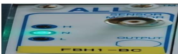
Fig 4. Channel Specification.

In this project, we tend to summarize the acoustic steam outflow identification applications in boiler of a thermal power plant station. According to our research, the acoustic technology has wide application in boilers. Early detection of faults will decrease the amount of repairs to be made and the unit downtime.The main monitoring system is the frequently used for reading analysis. The positive mark indicate the normal level of boiler and whenever the leakage occurs it will turn off from green indication to red indication. It indicates the leakages in water tubes and steam tubes.