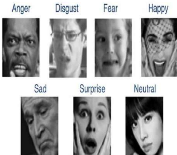
Fig 1. Facial Expression Recognition.

The facial expression recognition works for knowing the mood of the person present in the image or video [7]. The expression can be of many types such as happy, unhappy, sad, fear, disgust, crying, angry, tensed, surprised etc. All this expression can be studied from the image given as input. The evaluation of expression can be done by giving pre-training to the computer. The already set expressions can be evaluated from the computer by applying the desired algorithm to carry out the results.