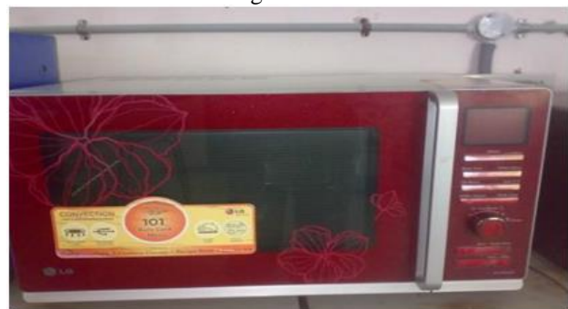
Fig 3. The photograph of the microwave reactor in the present investigation.

A microwave oven (900W, 2450 MHz, LG, Model MC 8080 PRR) used for kitchen appliances was used for the studies. The photograph of the microwave oven modified as a reactor is shown in fig.3.