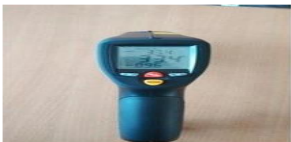
Fig.4 Infrared Thermometer used in the study

The major challenge in microwave process is the measurement of temperature during microwave heating. Thermocouple wire cannot be used during operation as they interact with microwave and generate eddy current. Thus the temperature was measured by using Infrared thermometer at intermittent periods. The IR thermometer is capable of non – contact (Infrared) temperature measurement at the touch of a button. The built – in laser pointer increases target accuracy while the backlight LCD and handy push button combine for convenient, ergonomic operation. The Non – contact Infrared Thermometer can be used to measure the temperature of object's surface that is improper to be measured by traditional (contact) thermometer.