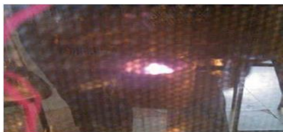
Fig4.1 Photograph showing the temperature rise by the exposure of the reaction mixtures to microwave irradiation and flame generated by the microwave interaction.

Interaction of Microwave with Reaction Mixtures and Heat Generation The reaction mixtures used in the present study consist of \text{Fe}_2\text{O}_3 and amorphous carbon (activated charcoal). Basically both are come into the category of subsector material i.e they absorb the microwave and generate heat energy. Fig. 4.1 shows the photograph of reaction mixtures generating high temperature while interacting with microwave in the present study.