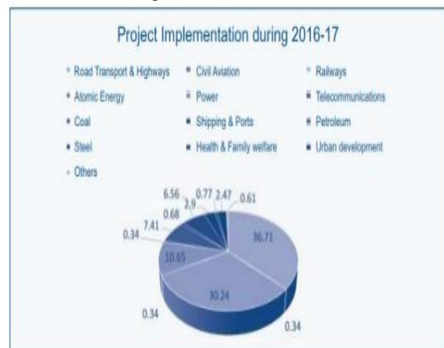
Fig. 1.

Statistics and Programme Implementation (MOSPI), GOI, F.Y. 2016-17 the main focus of the government on infra development is on road sector. As per Ministry records, as on 1 October 2016, 1174 projects with an anticipated cost of Rs 16,16,457.43 crore were on the monitor of the Ministry. 1174 projects are shown in the figure below sector wise break up ;