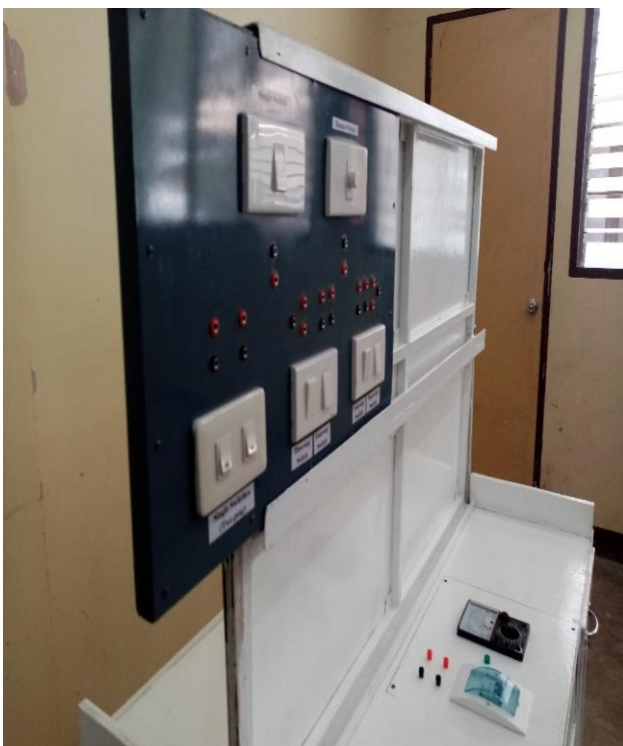
Fig. 9. Trainer set inserted on the Multifunctional Transformable Table used for demonstration

4. The table has its storage area for the trainer set when it's not used.