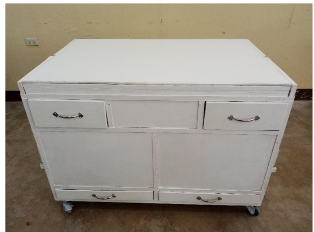
Fig. 2. Table form of Multifunctional Transformable Table

The Multifunctional Transformable Table can be transformed from a table into an instructional board such as the whiteboard and an instructional trainer set holder.