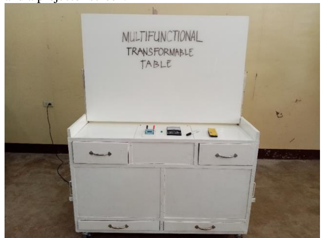
Fig. 6. Multifunctional Transformable Table used as a white board for instruction

3. The instructional board can be used as a whiteboard and a projector screen.