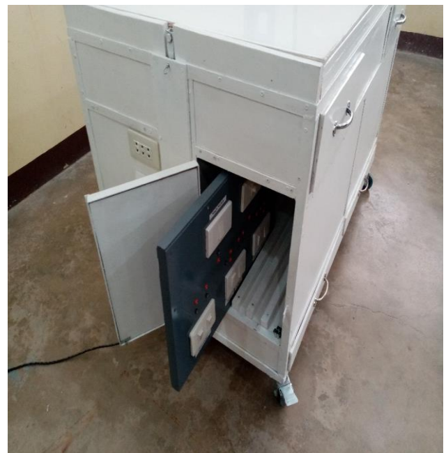
Fig. 11. Inserting the trainer set inserted in its storage area