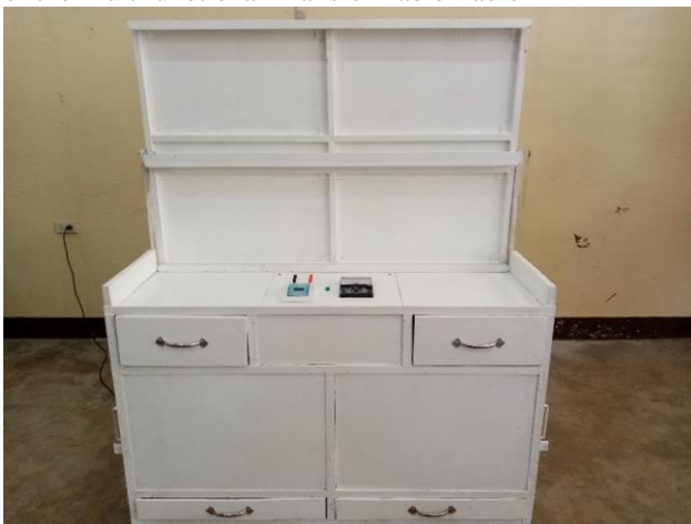
Fig. 4. Instructional Board (Trainer Set Holder) transformation of the Multifunctional Transformable Table

3. The instructional board can be used as a whiteboard and a projector screen.