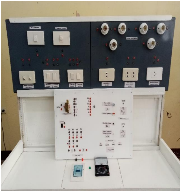
Fig. 8. Multifunctional Transformable Table as instructional board with trainer set.

4. The instructional trainer set has two different instructional activities for electrical installation, which are for building house wiring and full-wave rectifier wiring. Also, the trainer set is removable when it's not in use.