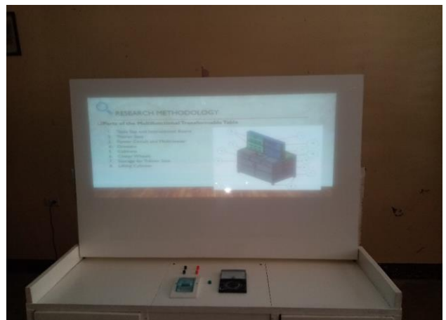
Fig. 7. Multifunctional Transformable Table used as a projector screen for multimedia presentation