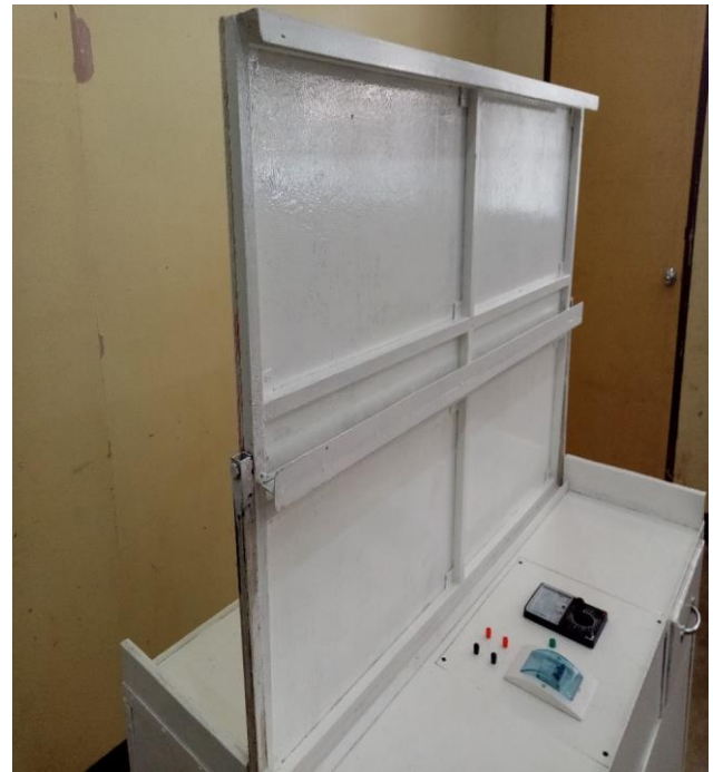
Fig. 10. Multifunctional Transformable Table in instructional board form without the trainer set.

4. The table has its storage area for the trainer set when it's not used.