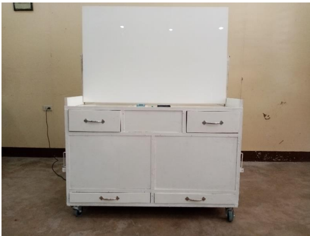
Fig. 3. Instructional Board (White Board) transformation of the Multifunctional Transformable Table