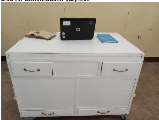
Fig. 5. Multifunctional Transformable Table used as a teacher's table.

2. The table can be used as a teacher's table and can be used for demonstration purposes