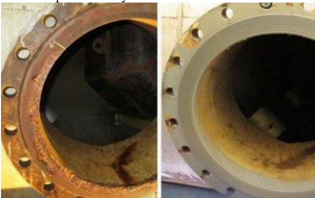
Fig.3. Corroded Pipe and Sprayed with Cold Spray Pipe.

In modern world, manufacturing and metal repairing companies are attracting use advanced technology and engineering coating methods that helps to increase high performance limits to enhance metal components and their usage in Aviation and Aerospace industries. Most of the companies adapting to Cold Spray Technology design guidelines to repairing tips to improve and extend the life of metal components and equipment's used in Aviation and Aerospace industry.