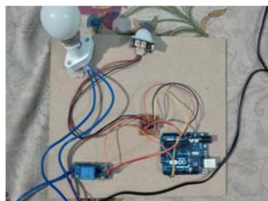
Fig.4. Bulb turns OFF when object leaves out of the room.