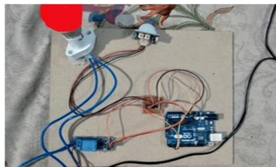
Fig.3. Bulb turns ON When object entered across PIR Sensor.